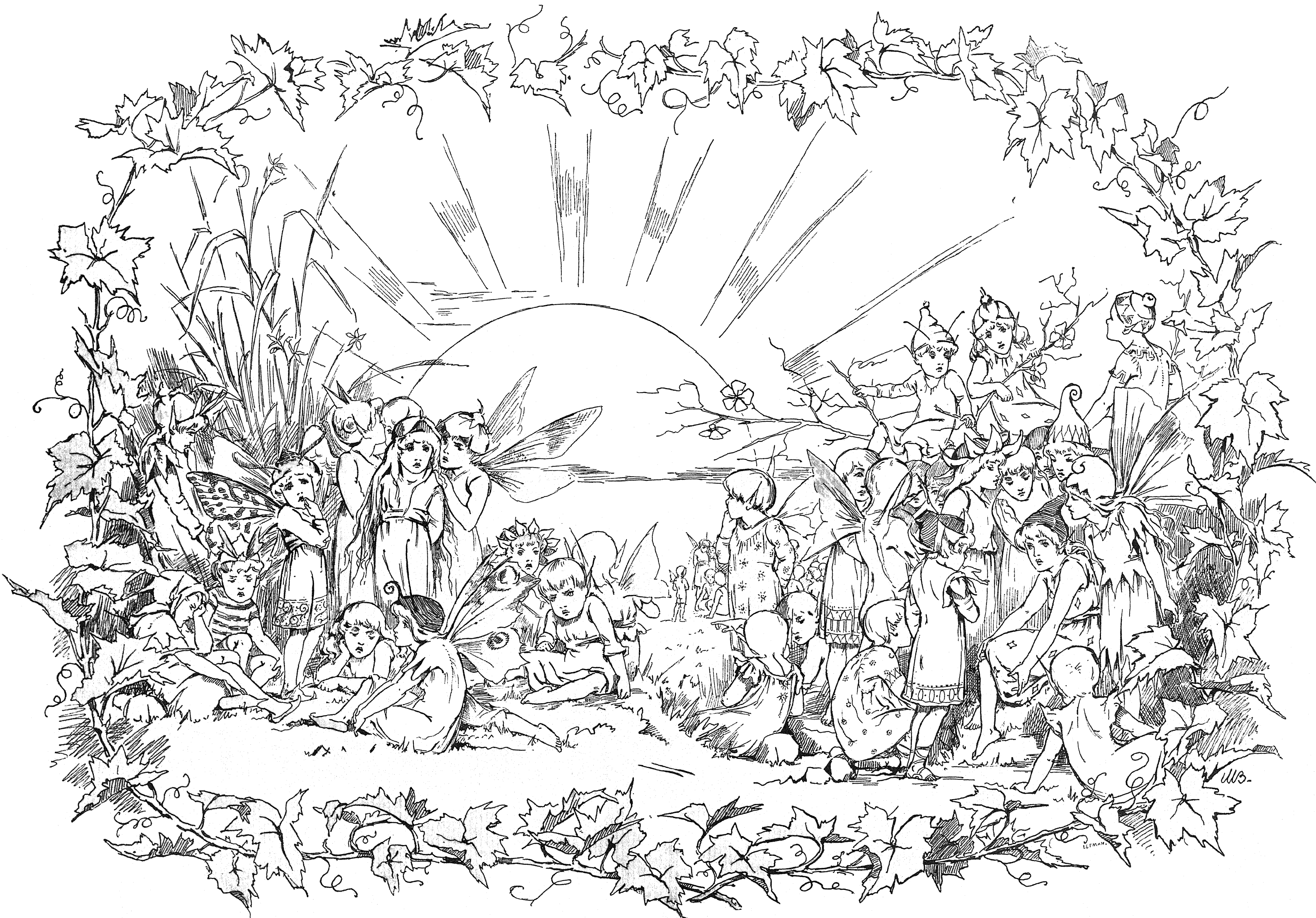
The three truants having returned to Fairyland and told their adventures on Earth, the other young Fairies who have never been to Earth, except an occasional visit at midnight, grow discontented with Fairy life and long to be like Mortals.