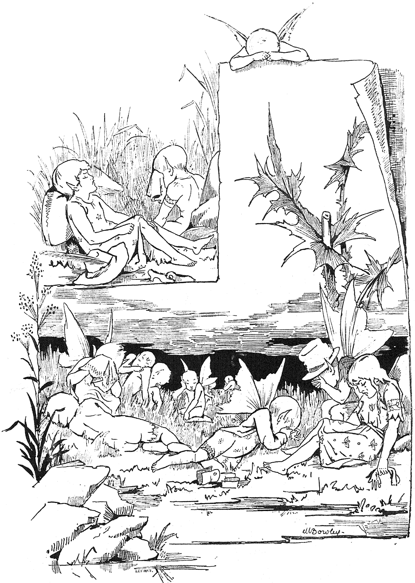
The terrible effect of the dinner party next day.