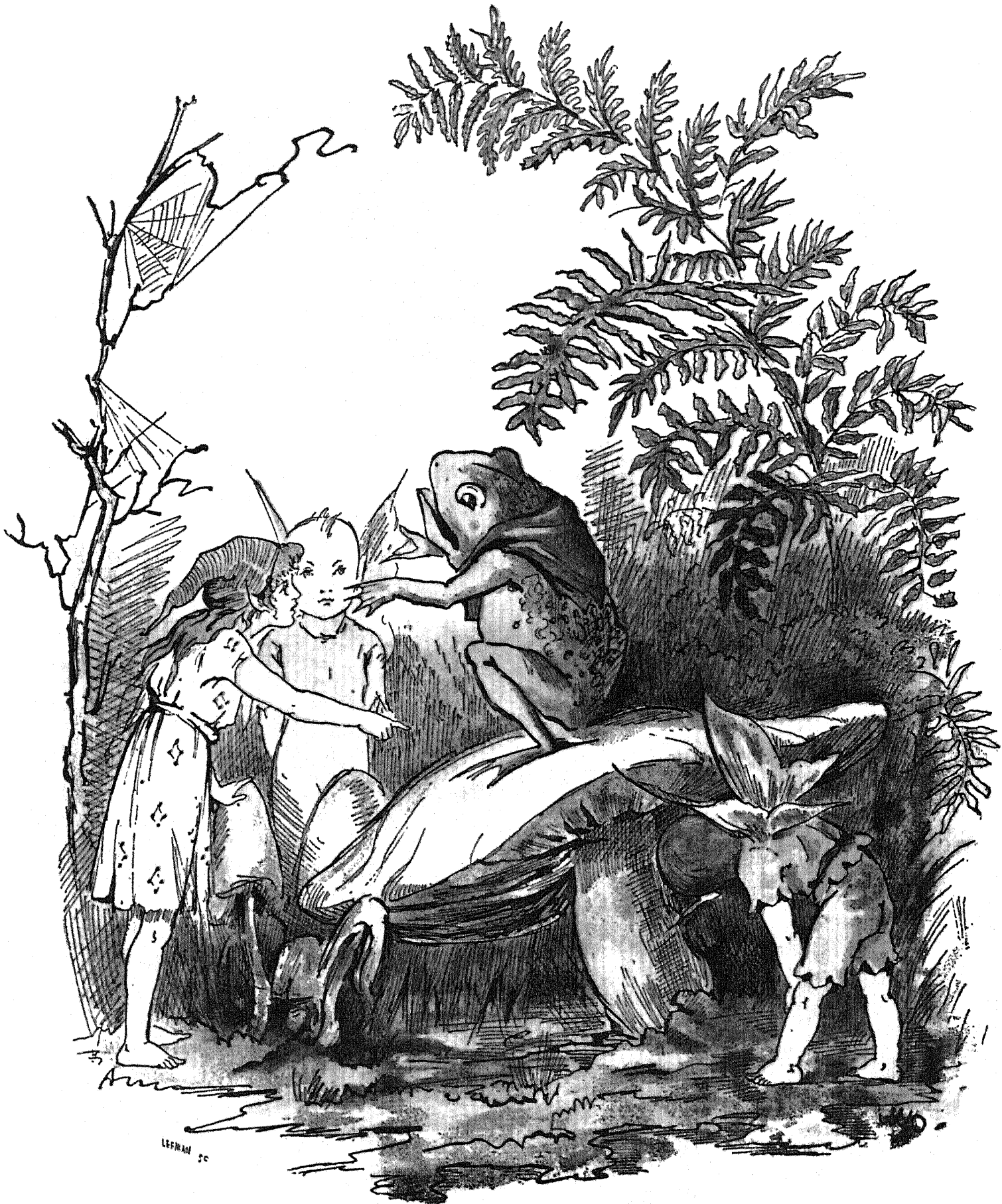
They make arrangements for lodgings.