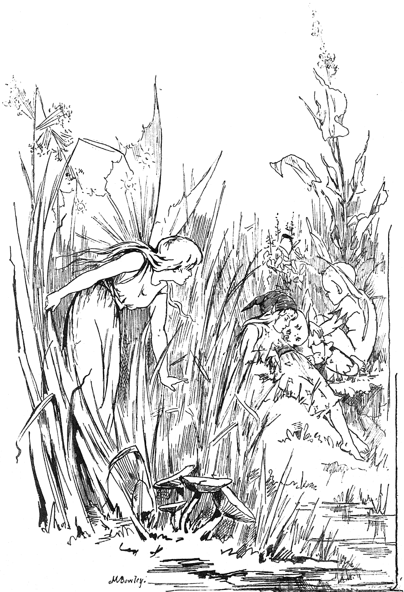
And finds her children at last, three very home-sick Fairies'