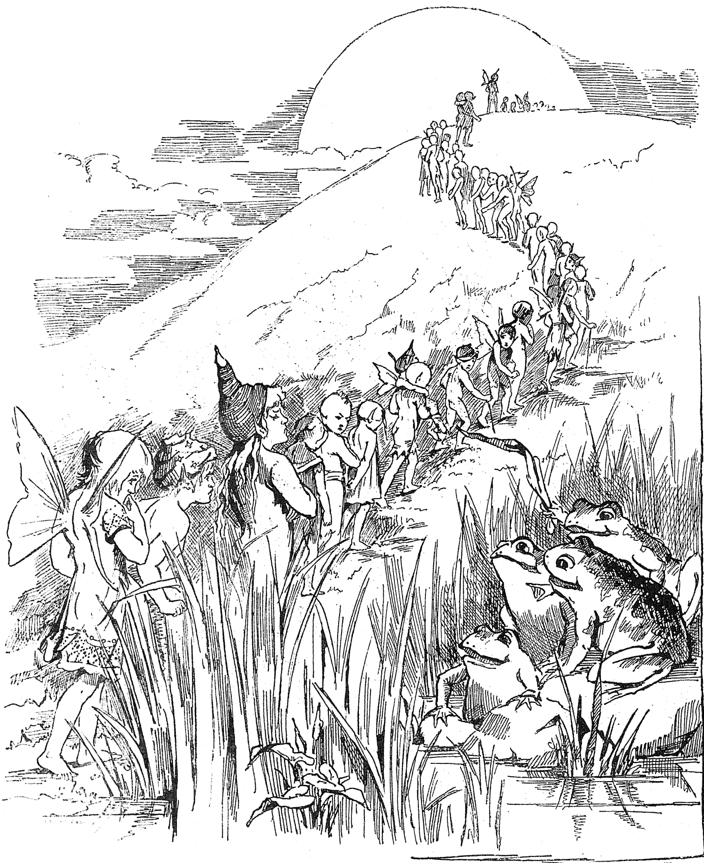
The return home of the sadder yet wiser Fairies. The Frogs come out to laugh and jeer as they march past.