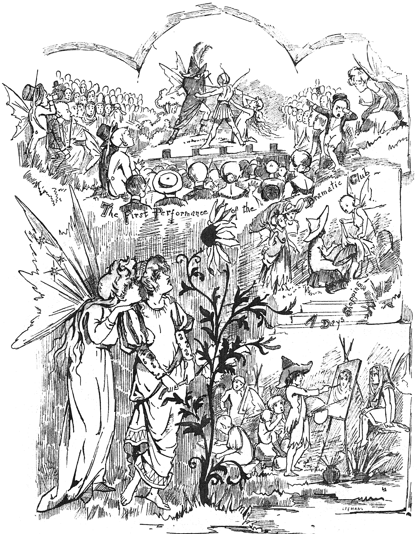
Some of the Fairies develop a taste for art.