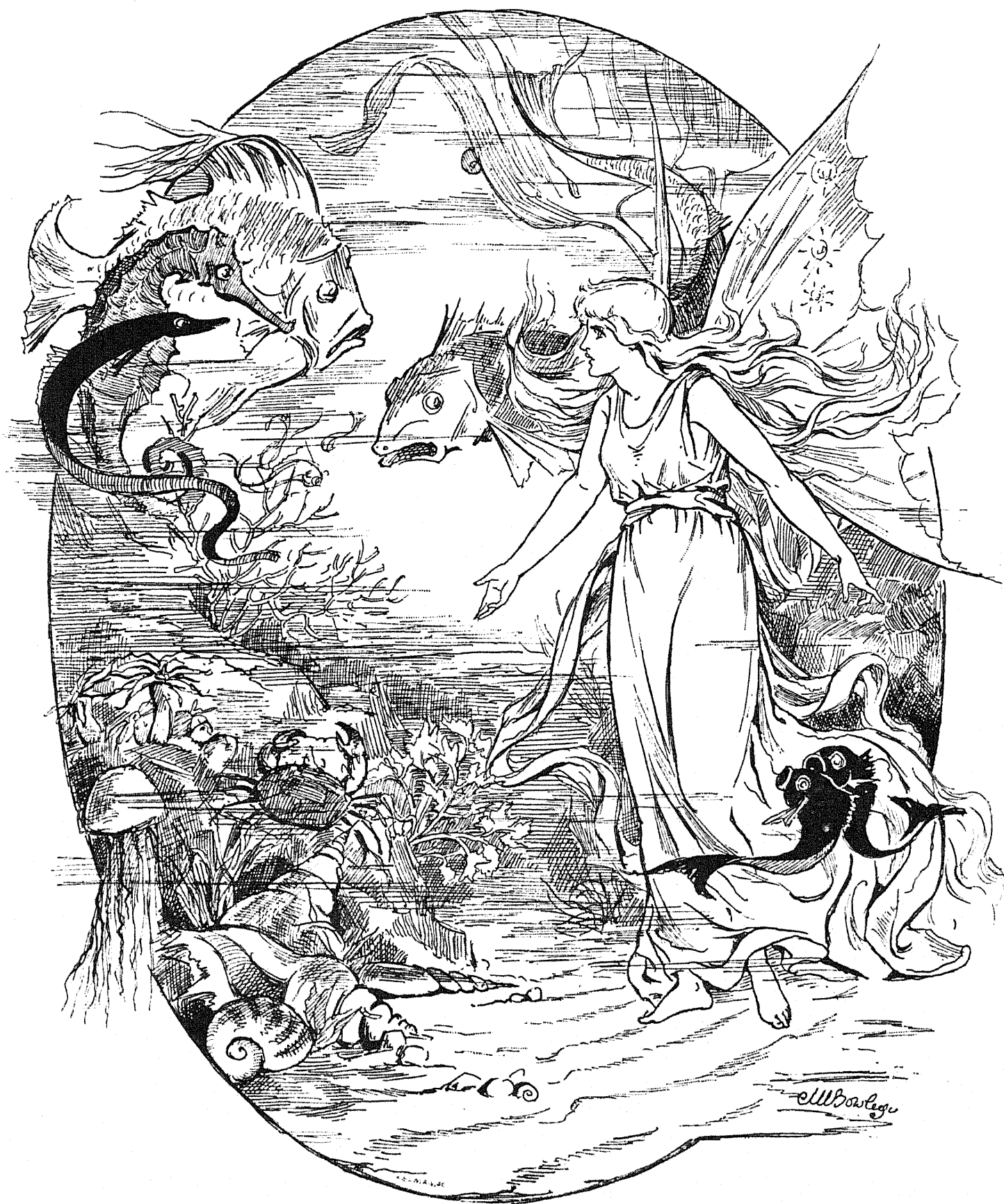
The Fairy Mother makes inquiries under the Sea,