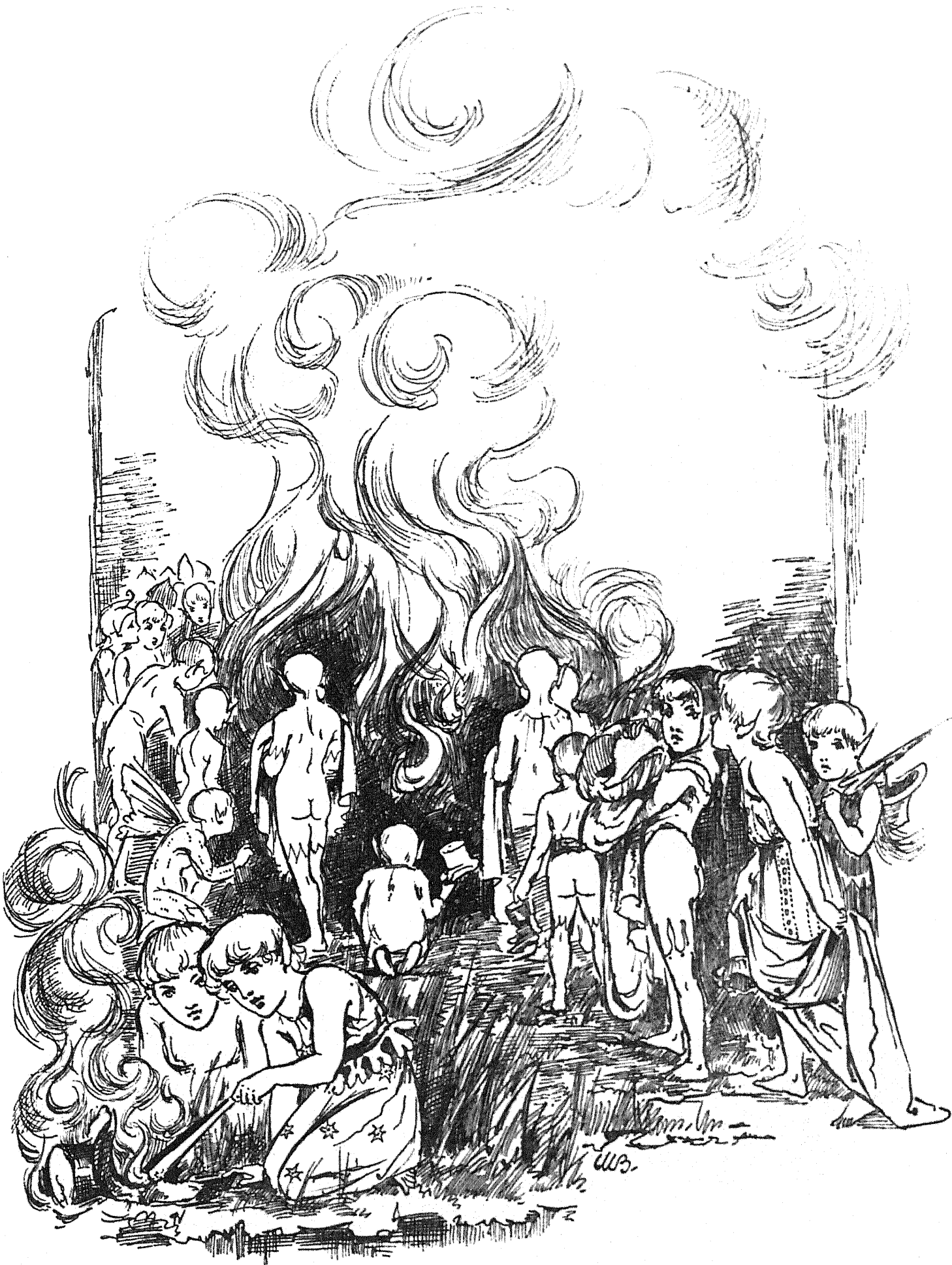
They make a large bonfire, and burn up all their fashionable clothes before starting for home.