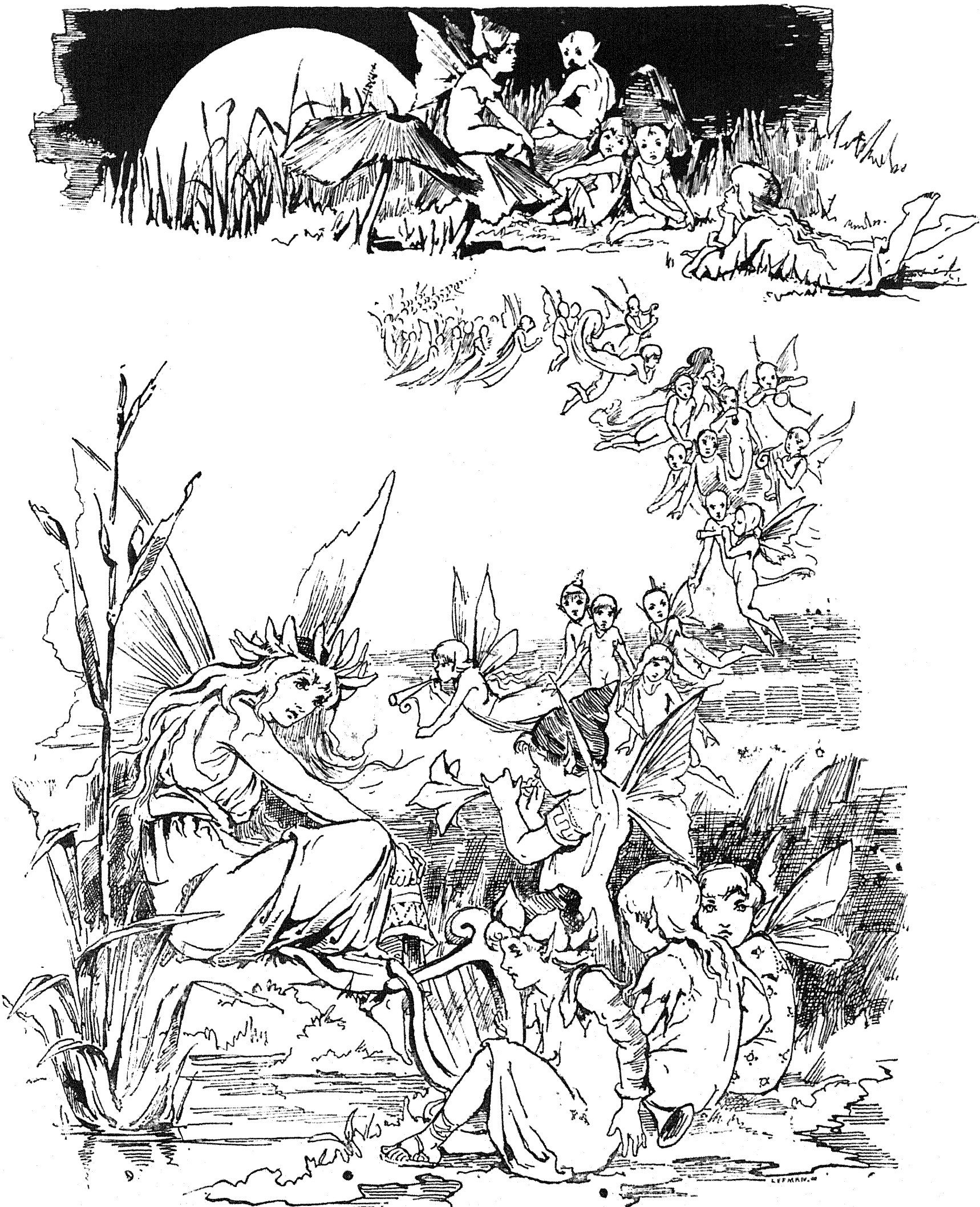
One night the Fairies, pining for a change, pay a visit to Earth.