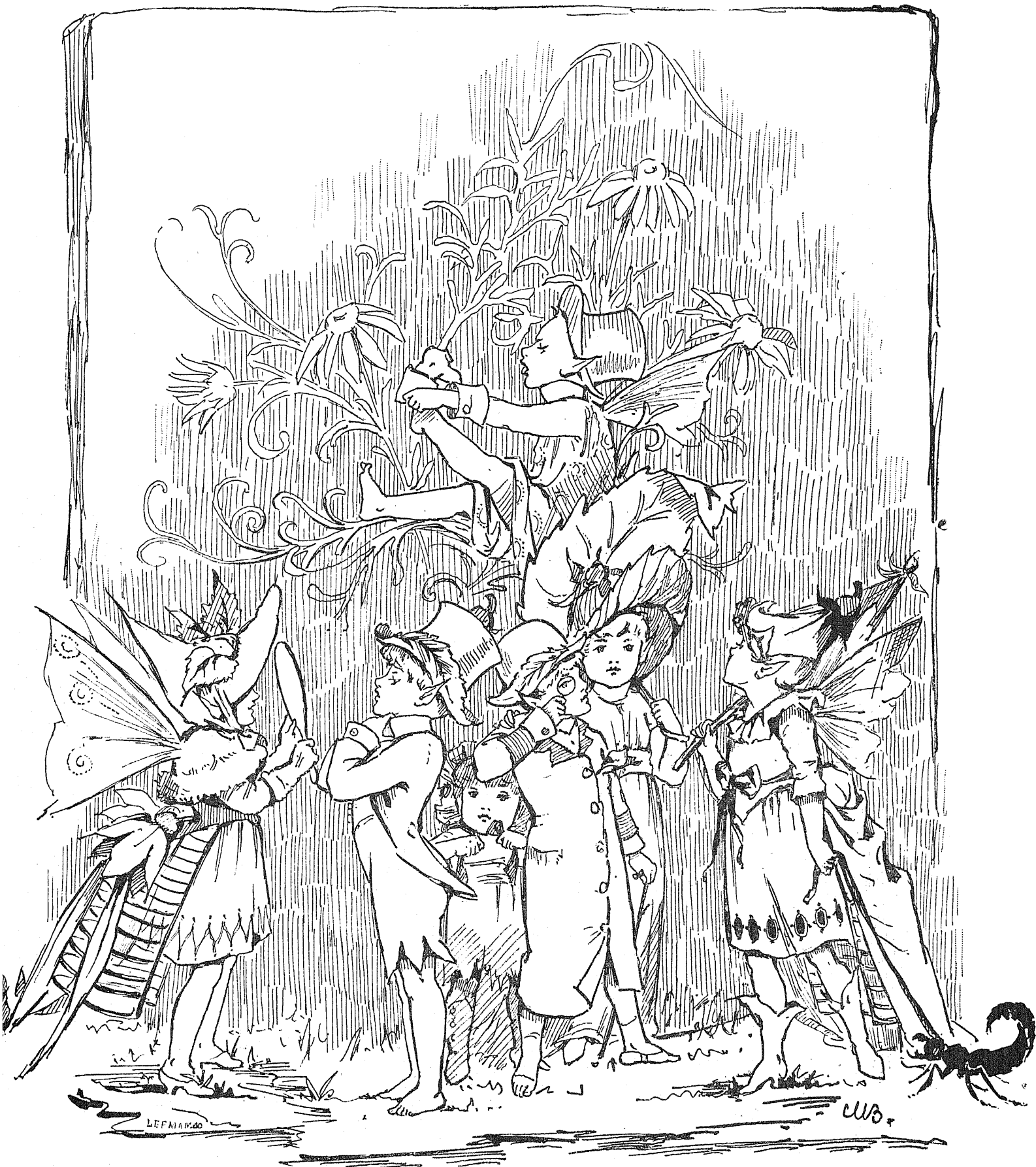
The Fairies start their new life, and dress in the latest Earthly style.